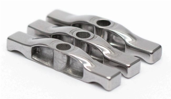
3D printing on the Shop System drastically reduces lead time of this lightweighted fixture

created a design that was able to conform to the buckles without damaging them while weighing 42% less than the traditional component. The decreased mass results in less machine wear, optimizing production performance.